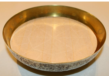
13. Paten w/5" host (Fr. Brooks)