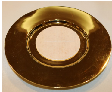
13. Paten w/2" host (Fr. Porter)