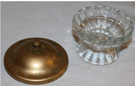
9. Oblation Bowl