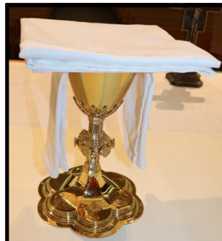
Fr. Porter's Chalice

1) Chalice, 2) Purificator on top of the Chalice, 3) Paten with 5" host on top of Purificator, 4) Pall on top of Paten, 5) Corporal on top of Pall