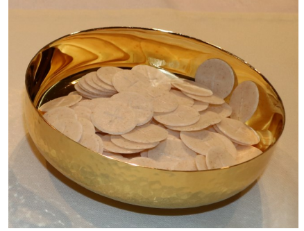
3. Ciborium (pl. Ciboria)