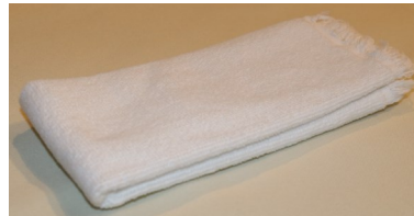
6. Finger Towel