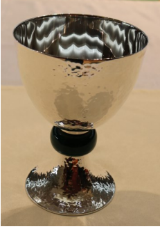
1. Chalice for congregation